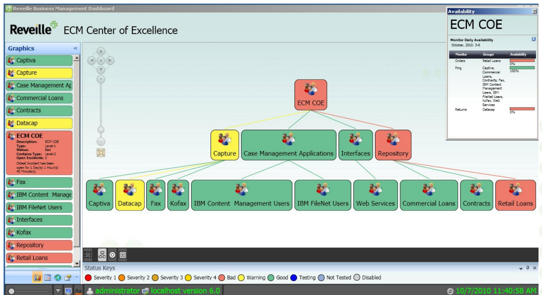
View the health of IBM FileNet components, processes and end-user response times on a graphical executive dashboard